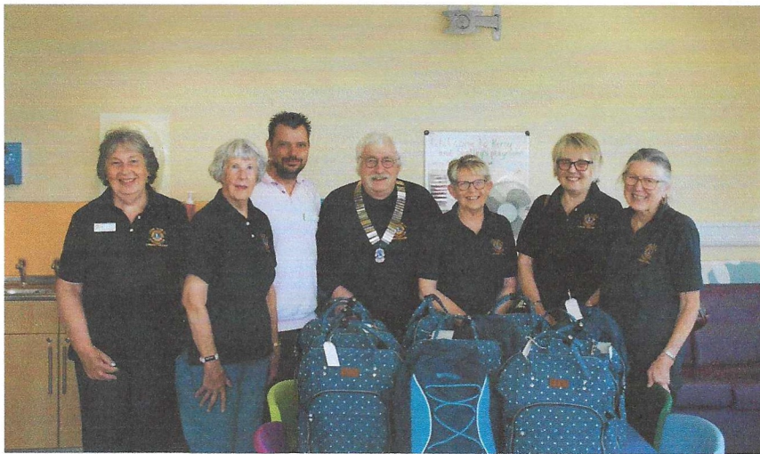
Representatives of Chichester Lions Club make deliveries of kits to a hospital in West Sussex.

Deliveries to St Richard's Hospital and Worthing Hospital would not have been possible without the tireless efforts of the Chichester Lions Club.