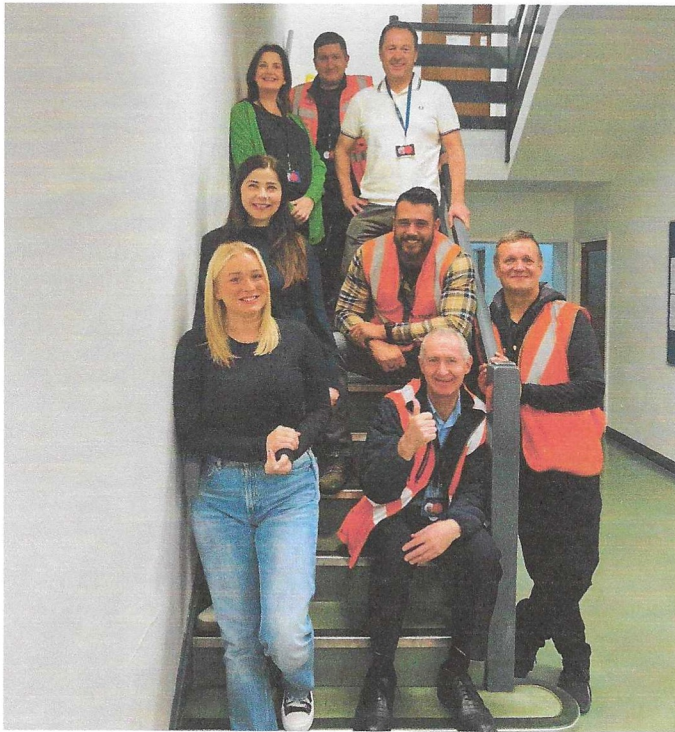
Volunteers from Alstom's Derby site prepare for a day of shopping and a day of packing.