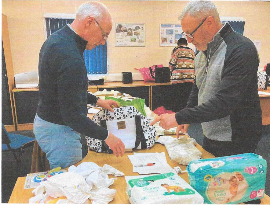
Alstom employees packing kits.